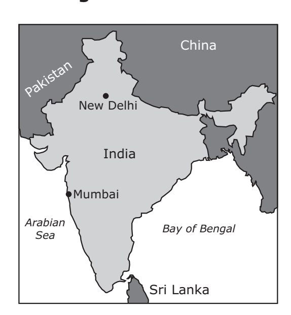
Page 1 of Selection

A map and a photograph were included with this selection in the printed version of the English I Reading test and are shown below.